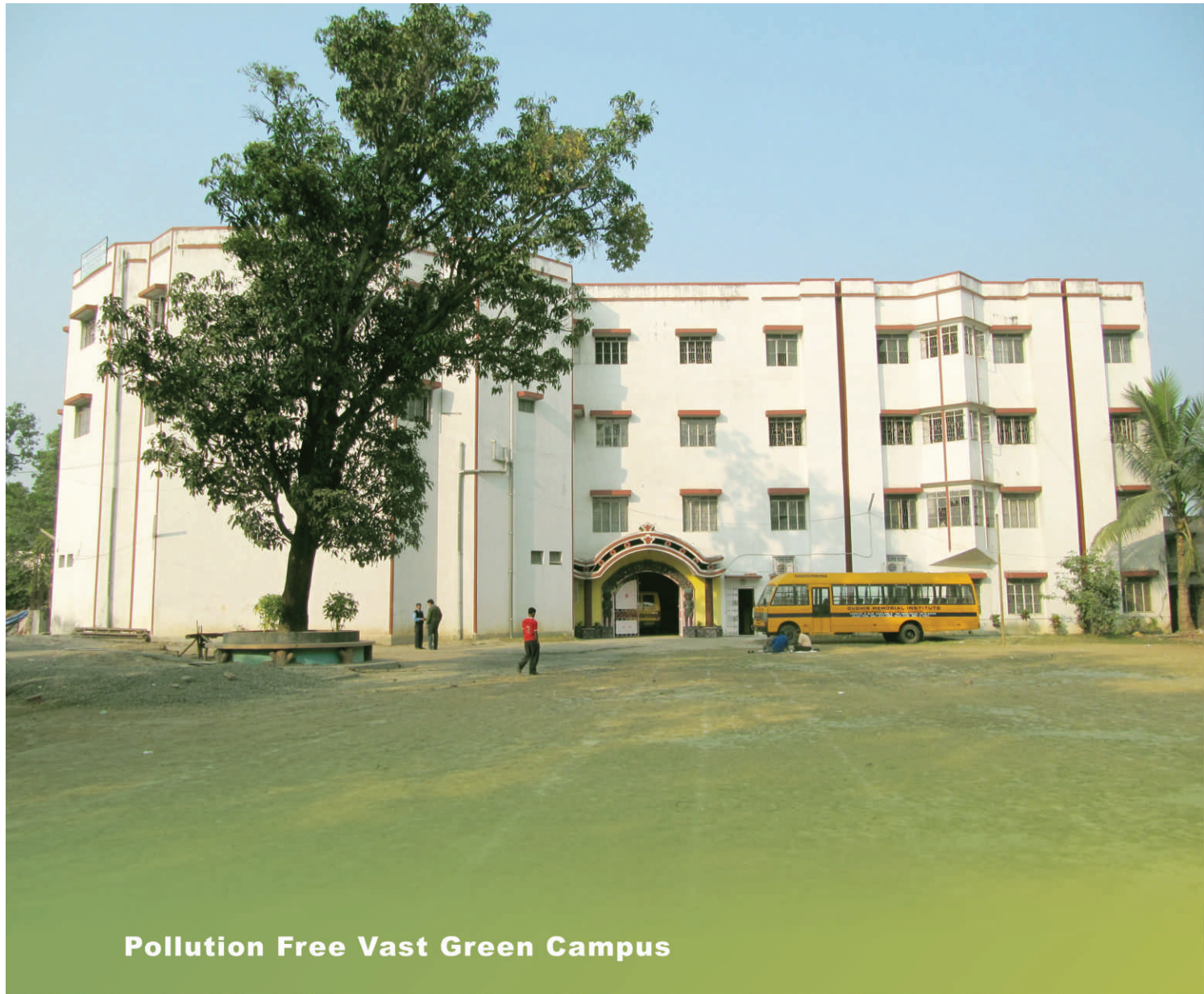
Pollution Free Vast Green Campus